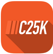
Couch to 5k (C25K)